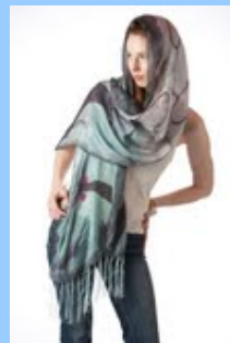
Striped silk scarf