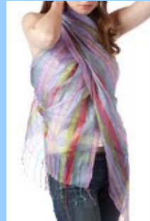
Water lilies-silk painted floral scarf

Founder www.shubrah.com http://Shubrah.blogspot.com shubhra@shubhradesign.com